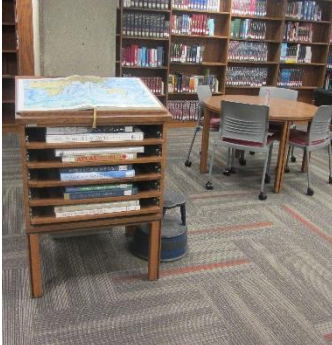
A glimpse of the refreshed space, August 2014.

Refresh planning began in the spring after surveying Clermont College students about their library experiences and ideas to improve the space. Our students' top request? More places to charge laptops, tablets, and other electronic devices. This summer we've added more than 150 electrical outlets on the 1<sup>st</sup> and 2<sup>nd</sup> floors. Additional improvements to the library include: